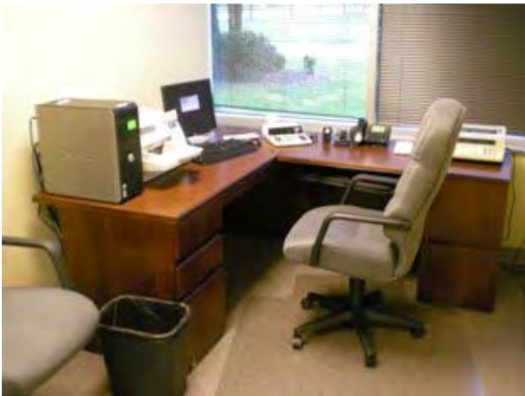
L-shape desk, wood with laminate inlay. 1) B/B/F & 1) F/F $650 each Quantity: 3