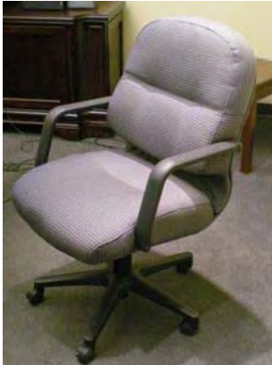
HON Pillowsoft Midback Conference Chairs Fabric: blueish grey $150 each Quantity: 8