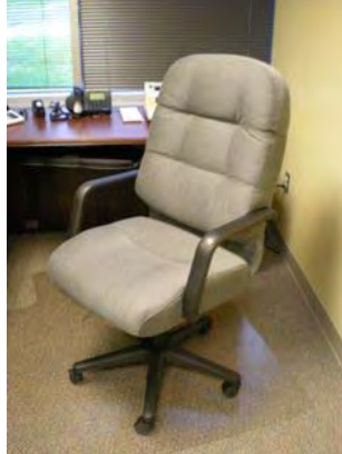
HON Pillowsoft Highback Chair Fabric: Grey $150 each Quantity: 7