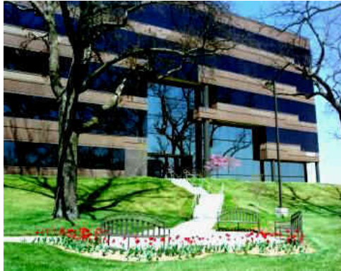
Southcreek Building V 12980 Metcalf, OPKS