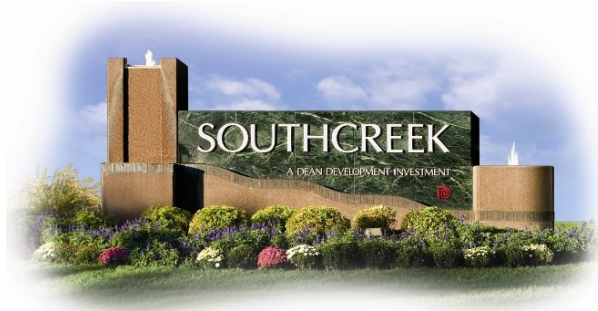
Building IVb—7304 W. 130th St., OPKS

855 RSF New to Market! Ready for Occupancy Terrific New Open Floor Plan With Lots of Glass Walking Access to Lake, Shops and Restaurants