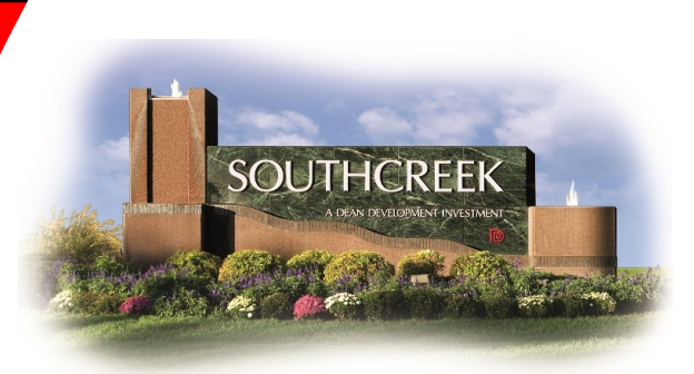
Building V—12980 Metcalf