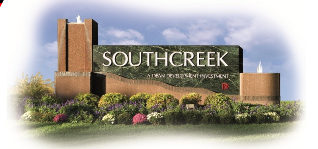
Building II—12920 Metcalf