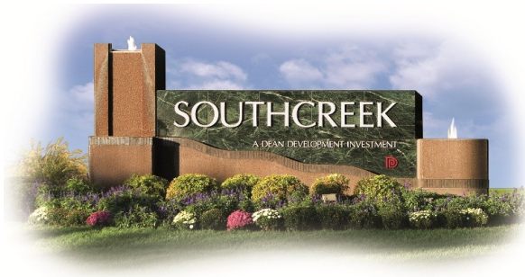
Building XIIA 7200 W. 132nd St.

New to Market Offices Plus Open Cube Area Great Location Close to Amenities On-Site Management