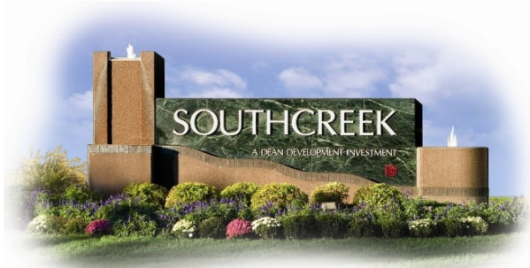
Building II—12920 Metcalf., OPKS

2,119 RSF Great Location Terrific First Floor Suite