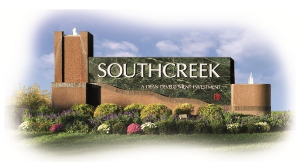
Building XIIB—7400 W. 132nd St. Virtual Tour