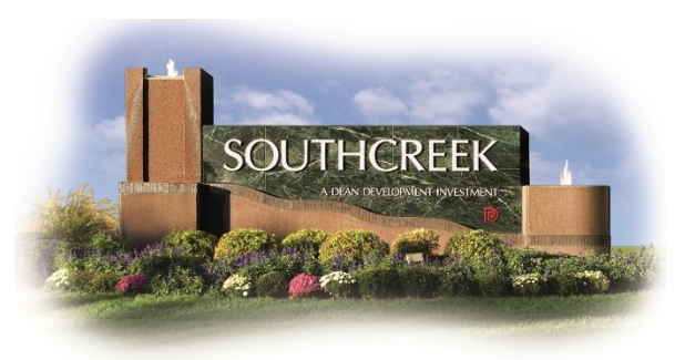
Building XIIB—7400 W. 132nd St.