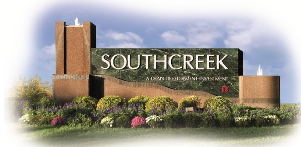
Building III—7201 W. 129th St.

1,275 RSF Terrific Small Suite on 1st Floor Move-In Ready Easy Access to Major Highways