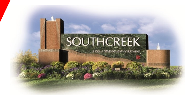
Building III—7201 W. 129th St.