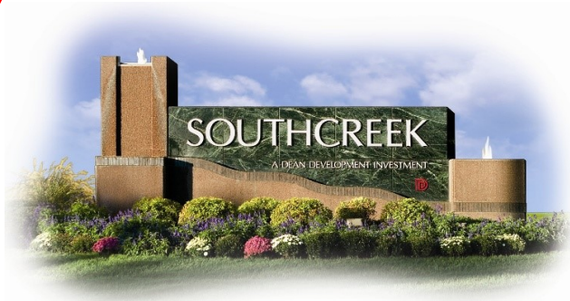
Building I, 12900 Metcalf