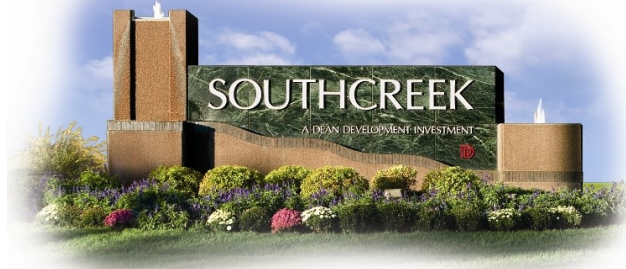
Building I, 12900 Metcalf