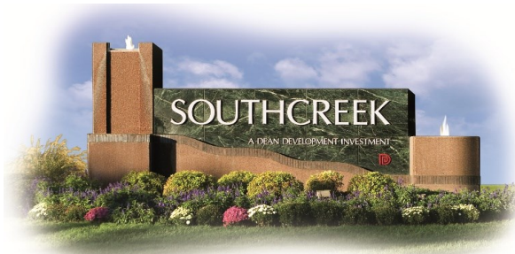
Building XIIB—7400 W. 132nd St.