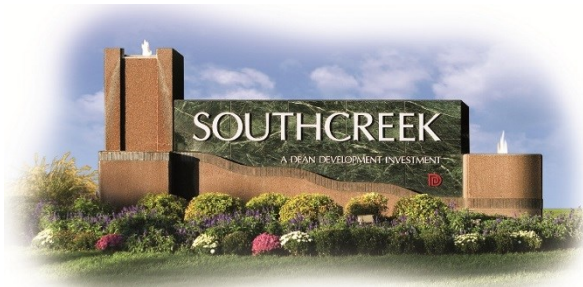
Building III—7201 W. 129th St.

Available 4th Quarter 2022 Easy Access to Major Highways On-Site Management