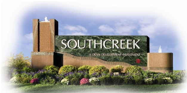
Building I, 12900 Metcalf

800 RSF 2nd Floor Suite Windowed Offices On-Site Management