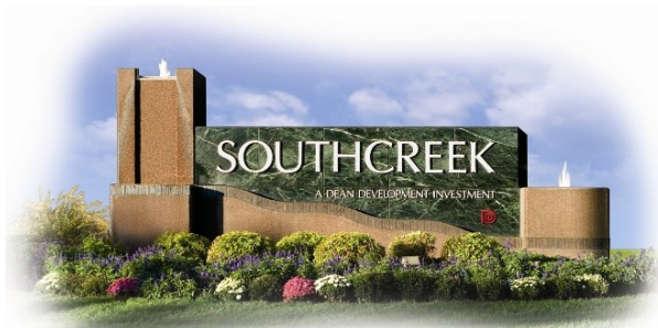
Building II—12920 Metcalf., OPKS