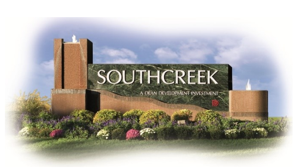
Building V—12980 Metcalf