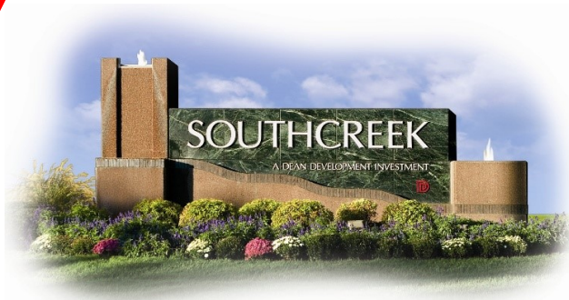
Building I, 12900 Metcalf