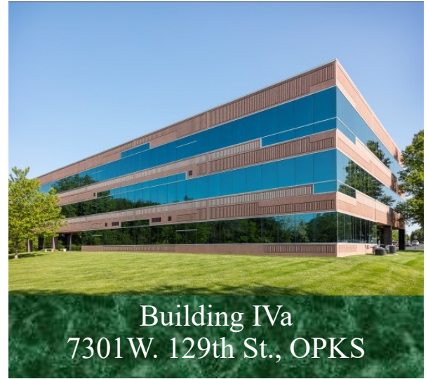
Building IVa 7301 W. 129th St., OPKS