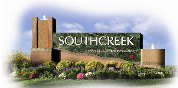
Building IVb—7304 W. 130th St., OPKS