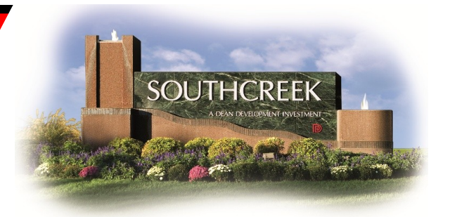
Building VIII—7415 W. 130th St.